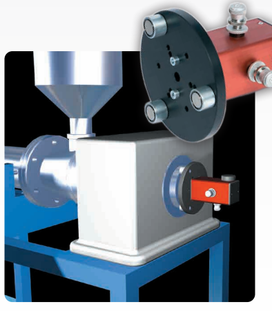
Laser transmitter on the gearbox spindle.