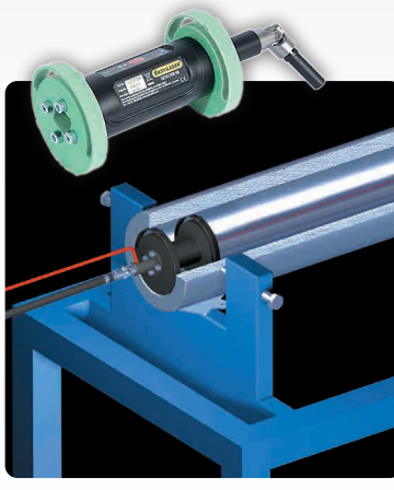
Detector with adapters in the tube.