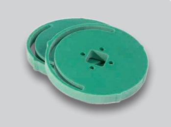
Tube adapters for detector (manufactured to order to fit the actual diameter).